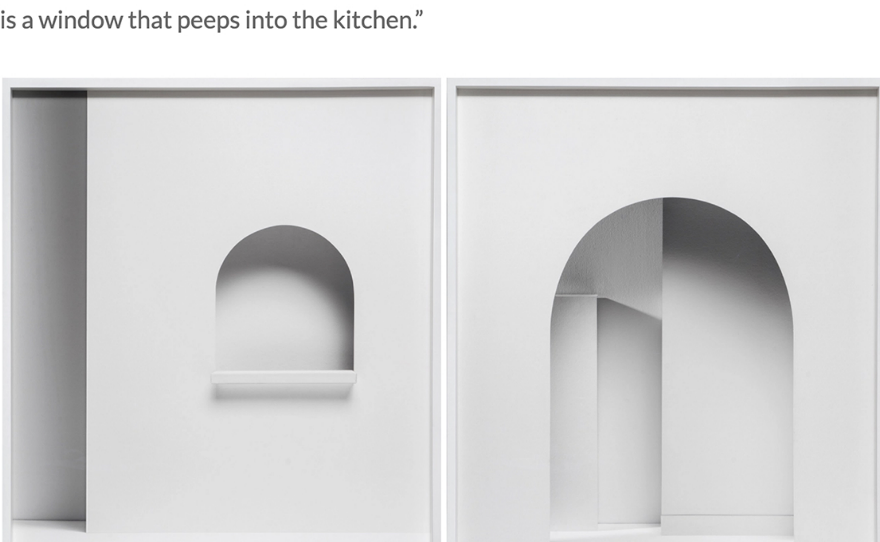
Welcome Back #2, 2018 © Liat Elbling

"The pieces titled Welcome Back , draw inspiration from a photograph of the same house—the doorway on the right is the entrance to my parents' bedroom and the left is a window that peeps into the kitchen."