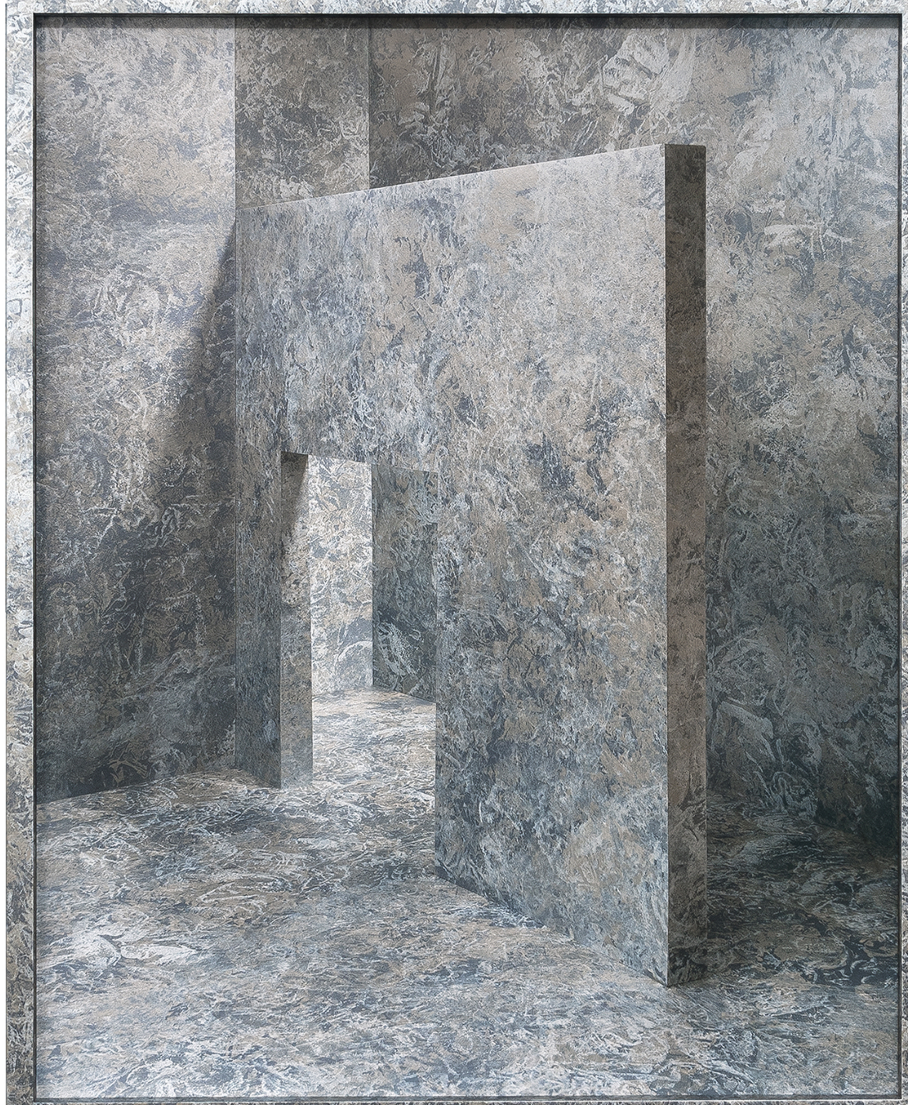
Within, 2018 © Liat Elbling

"These new works are a continuation of representation of empty and alien architectural spaces and include motifs from the house where I grew up. During the last two years, after my parents died, I had to deal with empty the apartment. The void house raised questions about the concept of space, emptiness and home, and the connection between all these in my work. 'Within,' which looks like a marble texture, seeks to express elements from the parents' home."