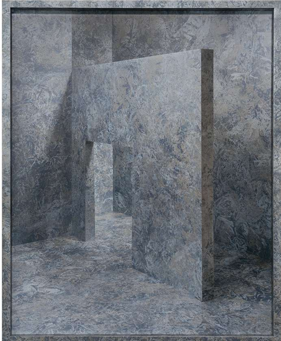
Within, 2018 © Liat Elbling

"These new works are a continuation of representation of empty and alien architectural spaces and include motifs from the house where I grew up. During the last two years, after my parents died, I had to deal with empty the apartment. The void house raised questions about the concept of space, emptiness and home, and the connection between all these in my work. 'Within,' which looks like a marble texture, seeks to express elements from the parents' home."